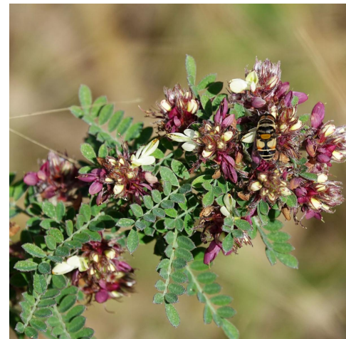
Dalea floridana (Florida prairieclover)

IRC has an E-Trade account. Please contact us about giving gifts of stock.